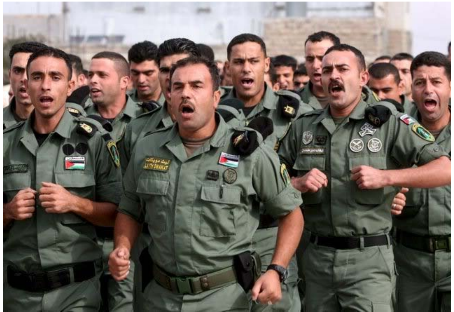
Palestinian Authority forces conduct exercise in Hebron in 2008