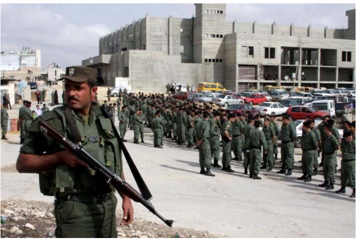
Palestinian Authority forces parade in the town of Hebron October 2008