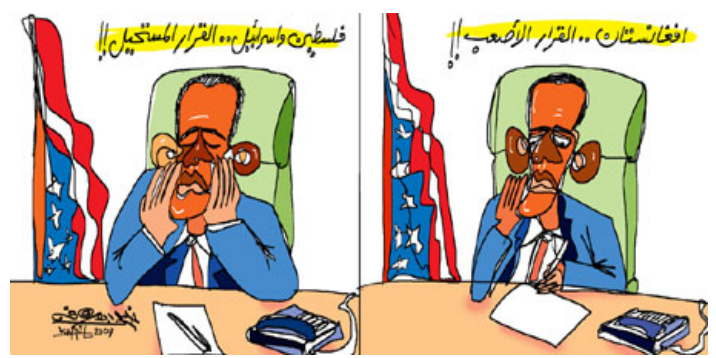
Pres. Obama: "Palestine-Israel is impossible." Al Quds

As a result, after more than three years of intense efforts, neither the Congress nor the American people have a clue as to the real effectiveness and performance of the Palestinian Authority security forces. The only measurements used by the State Department have been the size of the Palestinian Authority security forces or that of their training programs. There has been little or no mention of what are the security needs of the Palestinian Authority.