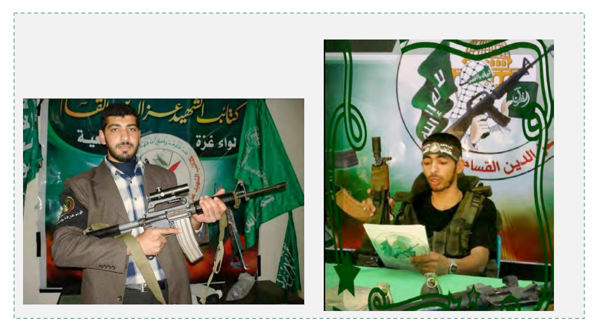
Left: A shaheed from Hamas' military-terrorist wing, killed in February 2008. The picture was posted by the Facebook page of the al-Salam mosque on the anniversary of his death. Right: A Hamas operative reads a memorial notice for a Hamas operative killed in the Gaza Strip in Operation Cast Lead, who used to pray at the al-Salam mosque.