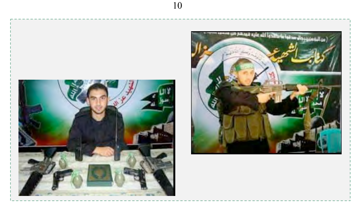
Death notices for two Hamas terrorist operatives killed in the Gaza Strip in Operation Cast Lead, who used to pray at the al-Salam mosque (Facebook page of the al-Salam mosque in Gaza, January 3, 2017).