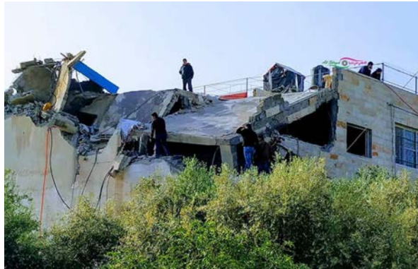
The demolished house of terrorist Omar Abu Layla in the village of al-Zawiya, (official Fatah Facebook page, April 24, 2019).

On April 24, 2019, the Israeli security forces destroyed the house where Omar Amin Abu Layla lived in the village of al-Zawya (west of Ariel). On March 17, 2019, Abu Layla carried out a combined shooting and stabbing attack at the Ariel Junction and at the Gitai Avisar Junction, killing an Israel civilian and an IDF soldier.