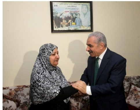
Muhammad Shtayyeh visits the Abu Hamid family.