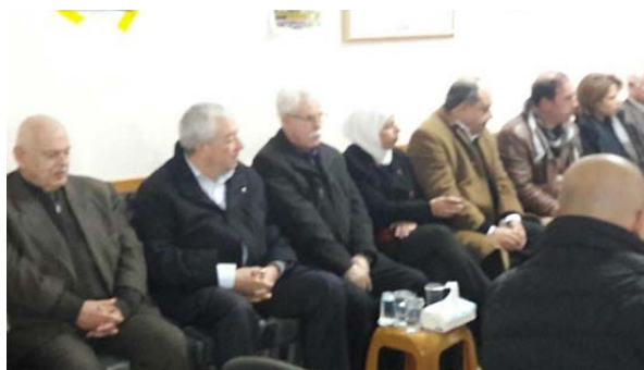
Right: Senior Fatah figures Mahmoud al-'Alul and Jamal al-Muheisen visit the mourning tent in Jenin (Mahmoud al-'Alul's Facebook page, January 22, 2018). Left: The mourning tent, picture from Fatah's official Facebook page (January 24, 2018).