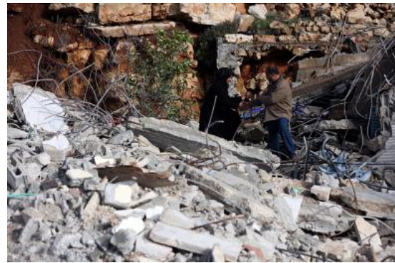
Right: The ruins of the house of Muhannad Halabi (Wafa, January 9, 2016) Left: Campaign to raise funds to rebuild the Halabi family's house (Quds Facebook page, January 10, 2016).