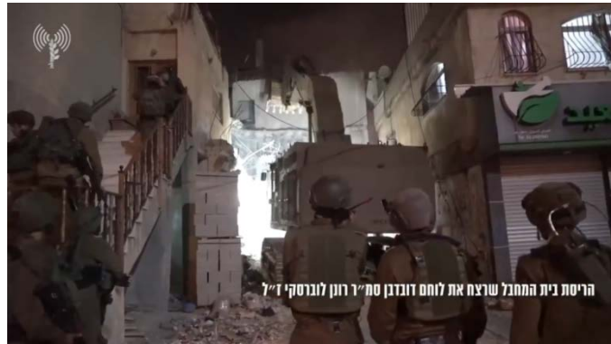
The destruction of the house of terrorist Islam Abu Hamid in the al-Am'ari refugee camp near Ramallah (October 24, 2019).