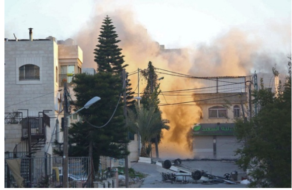
The destruction of the house of terrorist Islam Abu Hamid after the attack which killed a IDF soldier (Wafa, December 15, 2018).