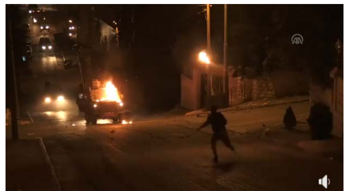
Palestinian rioters clash with Israeli security forces during the destruction of terrorist Islam Abu Hamid's house in the al-Am'ari refugee camp (QudsN Facebook page, October 24, 2019).