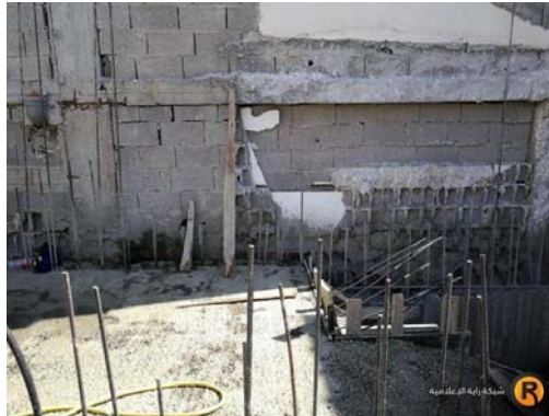
Rebuilding the Abu Hamid house in the al-Am'ari refugee camp in Ramallah (Raya News website, September 2, 2019).

► On the night of October 24, 2019, Israeli security forces demolished the house that was under construction. As in previous cases, support from the PA for rebuilding the house was promised to the family in Mahmoud Abbas' name. The PA and the Abu Hamid family seem to be playing cat and mouse with the Israeli security forces. The Palestinian media reported that it was the fifth time since 1994 that the IDF had destroyed the Abu Hamid house (Wafa, October 24, 2019).