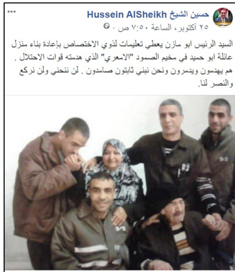
Post supporting the Abu Hamid family from Hussein al-Sheikh on his Facebook page. It says that Mahmoud Abbas ordered the rebuilding of the family's house (Hussein al-Sheikh's Facebook page, October 24, 2019).