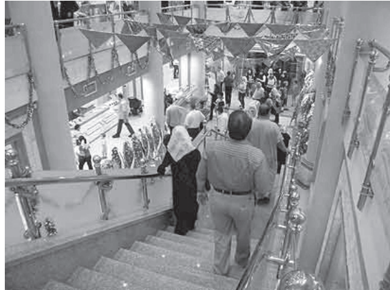
A Gaza mall bustles in July 2010. On November 11, 2010, Ging complained of persistent supply problems attending the Israeli blockade. Yet two weeks later, he rebutted this assertion, as well as the claim by UNRWA’s commissioner-general Filippo Grandi that Israel had not allowed the entry of a single truckload of construction materials, by acknowledging that “the shops were full of consumer goods.”

What Ging neglects to acknowledge is that Israel continues to send water into Gaza even though there is no requirement to do so according to international law: Every year Israel provides five million cubic liters of water to Gaza, transferred through three pipes—one in the center of the Gaza Strip and two in the south-