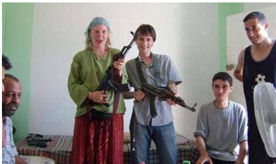
Huet-Vaughan's ISM colleagues in Israel who he roomed with.