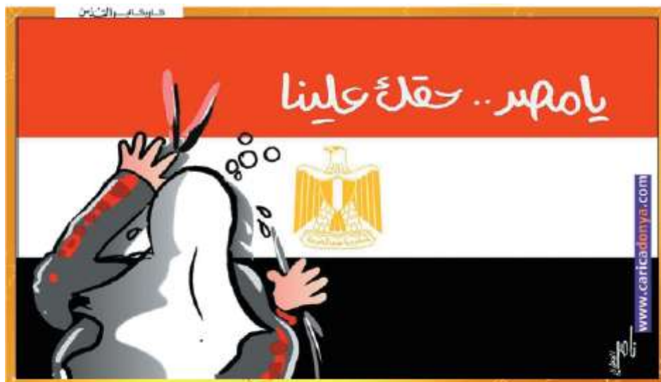
Al Quds. Jan. 6, 2006