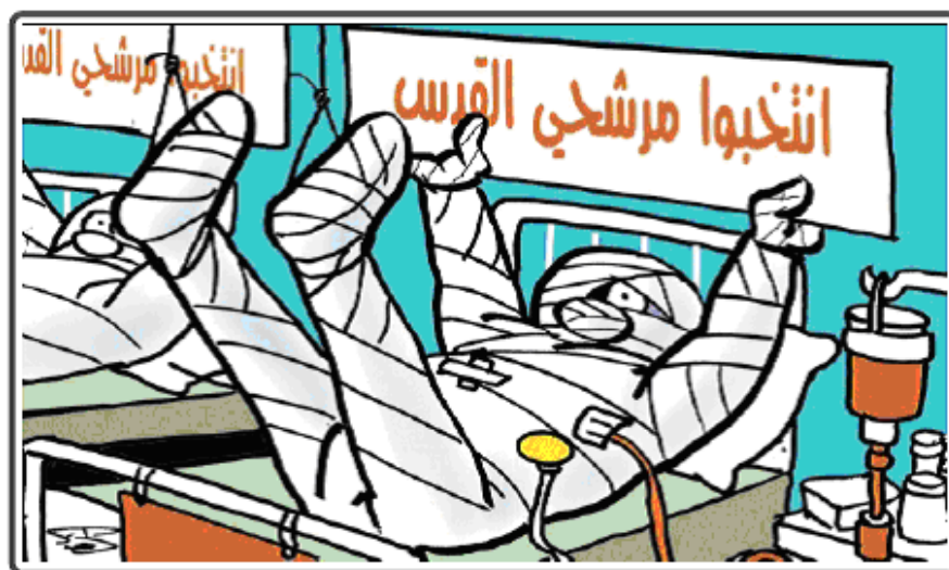
Al Ayyam. Jan. 4, 2006

"We insist that elections be held on time," Qurei said. "[But] there will be no elections without Jerusalem."