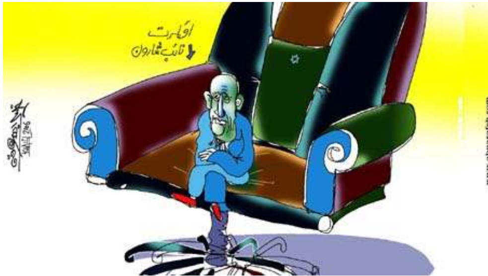
Al Quds. Jan. 6, 2006

"Will Sharon's health be used to hinder the polls?" senior PA negotiator Saeb Erekat asked on Jan. 25. "There are many questions we cannot answer at this stage."