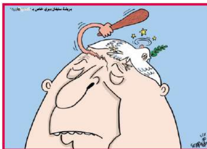
Al Hayat Al Jadeeda. Jan. 6, 2006

"Who will fill the vacuum left by Sharon," Al Quds worried in a headline on January 7.