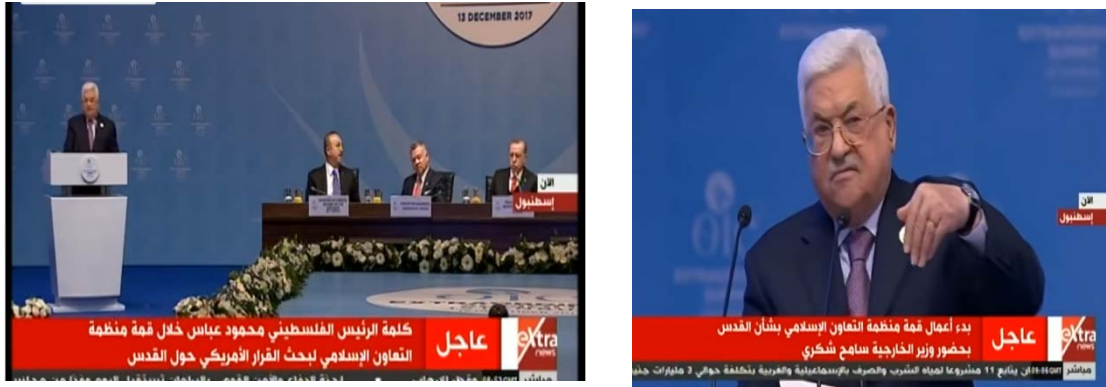
Mahmoud Abbas at the Organization of Islamic Cooperation conference in Istanbul held to discuss Jerusalem.