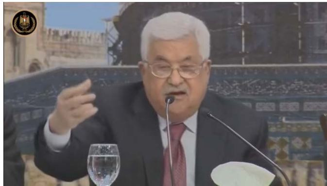
Mahmoud Abbas opens the Palestinian National Council conference in Ramallah (Wafa YouTube channel, April 30, 2018)

► Mahmoud Abbas claimed he had provided a historical survey in response to the "incorrect story Israel is trying to market." To make his statement more credible, he also claimed that everything he said was based on books written by Jews. He ended his "history lesson" by calling for a two-state solution, proclaiming, "We don't say, let's expel them. [We say,] let us live with them on the foundation of two states" (Wafa, April 30, 2021).