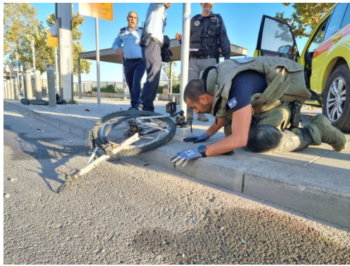
The scene of the terrorist attack at the bus stop at the Tel Aviv exit from Jerusalem.