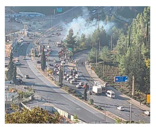
The IED explosion at the Ramot Junction. Left: Bus damaged by the explosion at the Ramot Junction.