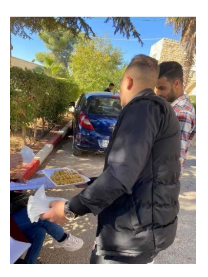
Right: Students from the al-Aroub branch of the Palestine Polytechnic University in Hebron hand out pastry and candy. Left: Students from the information technology department the Palestine Technical University – Khadourie/al-Aroub. The inscription reads, "World Cup of occupied Jerusalem – #Jenin Nablus Jerusalem???" (Paldf Twitter account, November 22, 2022).