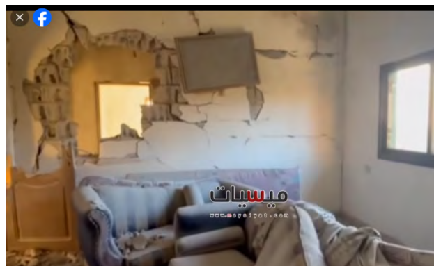
Damage caused in Meiss al-Jabal