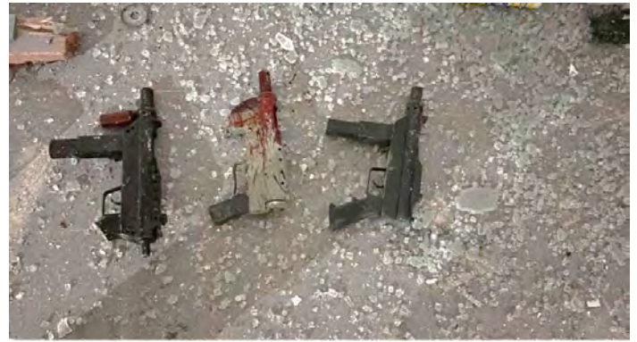
Right: The weapons found in the possession of the armed operatives in 'Azzun (IDF spokesperson's X account, January 2, 2024). Left: Palestinians gather near the site where the armed squad was killed (Shehab X account, January 2, 2024)

► In another activity to locate weapons in the city of Qalqilya, an IDF force shot at an armed Palestinian who shot at it and killed him (IDF spokesperson's Telegram channel, January 2, 2024).