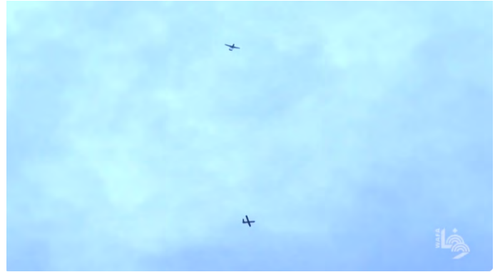
Right: Israeli Air Force aircraft in the skies above Khan Yunis. Left: IDF attacks on Khan Yunis