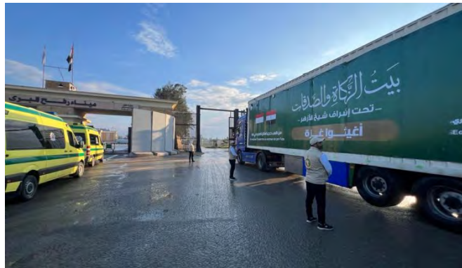
An Egyptian Zakat [Charity] truck brings humanitarian aid to the Gaza Strip through the Rafah crossing (al-Ghad TV, January 2, 2024)

►The Hamas-controlled Gaza Strip crossing authority reported that since October 21, 2023, 5,294 humanitarian aid trucks entered the Strip, according to the following distribution: 397 trucks of medical equipment, 211 of medicine, 53 of medical appliances, 2,641 of food, 833 of water, 179 of cleaning materials, 59 of kitchen utensils, 94 of shoes and clothing, two of duffle bags, 497 of blankets and carpets, 125 trucks of tents and awnings, and one of electrical appliances and solar panels. In addition, 1,896 gas tanks and 3,793,177 liters of fuel were delivered, and 81 new ambulances (al-Ghad TV, January 1, 2024).