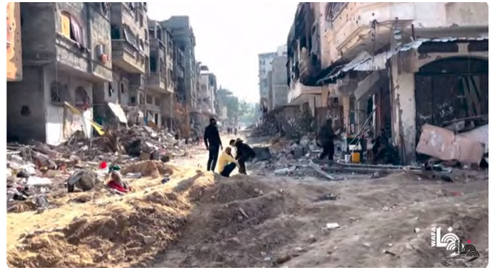
Beit Lahia (right) and Jabalia (left) (Wafa YouTube channel, January 1, 2024)