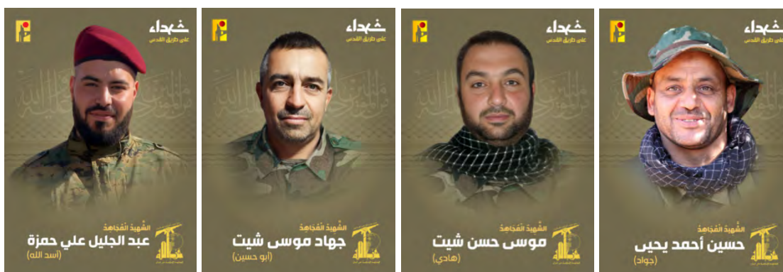
Hezbollah fatalities (Hezbollah's combat information Telegram channel, January 1, 2024)