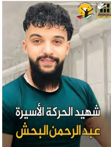
Abdul Rahman al-Bahsh (Palestinian Authority for Prisoners and Released Prisoners' Affairs Facebook page, January 1, 2024)