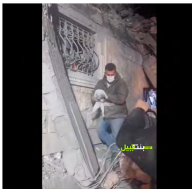
Rescuing a cat from the ruins of a house (bintjbeil.org Facebook page, January 1, 2024)