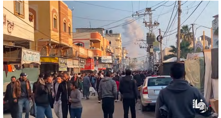
Right: Residents in the center of Deir al-Balah with IDF attacks in the central Gaza Strip in the background. Left: Mahmoud al-Louh, an al-Ghad TV correspondent, reporting from Shuhadaa al-Aqsa hospital in Deir al-Balah

► The southern Gaza Strip: IDF forces operating in the Khan Yunis area attacked a number of terrorist facilities, raided apartments where weapons were stored and from where terrorist operations were directed, and located large quantities of weapons (IDF spokesperson, January 2, 2024).