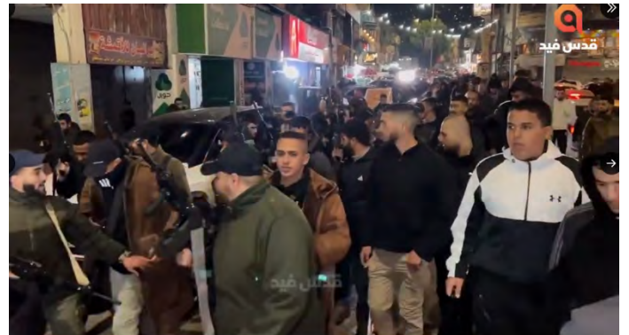
March and military display organized by the Jenin Battalion in support of the "resistance" in the Gaza Strip (@Khaldounnaji X account, January 1, 2024)