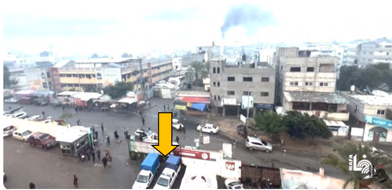
Hamas police vehicles parked at the main entrance to Nasser Hospital (Wafa YouTube channel, January 2, 2024)