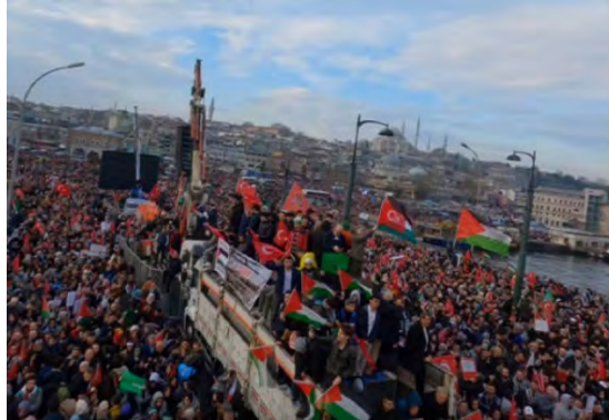
Mass demonstration in Istanbul in support for the Palestinians (Anadolu News, January 1, 2024)

► On January 1, 2024, a mass demonstration of support for the Palestinians was held in Istanbul (Anadolu News, January 1, 2024).